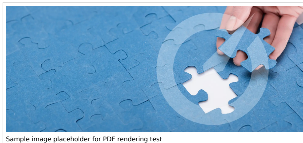
Sample image placeholder for PDF rendering test

This page demonstrates typical wiki content elements and is designed to compare PDF output before and after customizing the standard PDF CSS in BlueSpice. It serves as a practical example for evaluating how layout, formatting, and styling can be improved to achieve more professional and readable PDF exports.