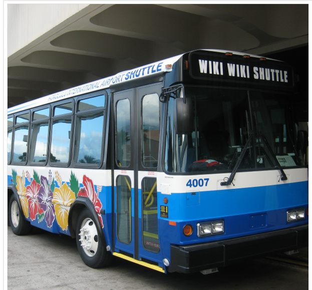
Wikiwiki Shuttle in Hawaii

Wikis use specialized wiki software and are often created in a very collaborative environment. The content is typically non-linear. In order to find relevant information, a powerful search function becomes very important. There are, however, many ways to organize a wiki so that users can navigate to content without relying only on the search function of their wiki.