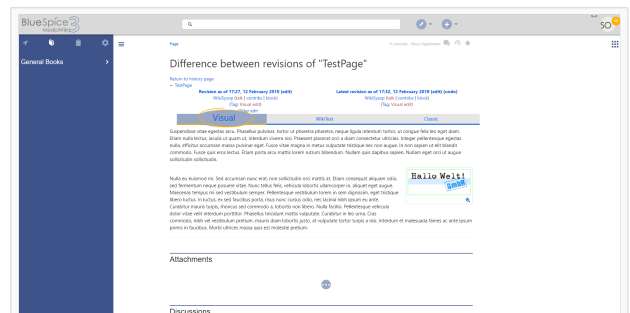
Viewing the VisualDiff

A change can be “added”, “deleted”, “changed”, or “conflict” content. Due to the nature of wiki articles, “changed” and “conflict” are very rare. “Changed” will be shown e.g. if a word was linked subsequently. All other changes (although being “changed” as well) are shown as “added” or “deleted”.