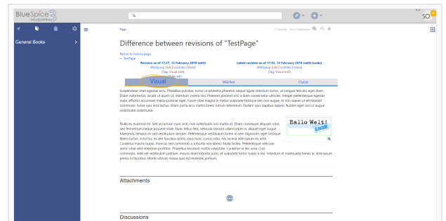
Viewing the VisualDiff